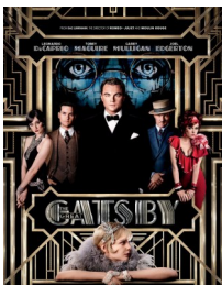
The Great Gatsby