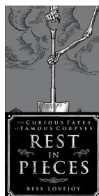
Rest in Pieces : the Curious Fates of Famous Corpses, by Bess Lovejoy.