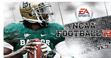
NCAA Football 13