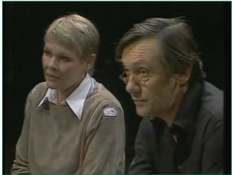
Judi Dench rehearses Viola from Twelfth Night . From Theatre in Video documentaries.

Some features of Theatre in Video include the ability to watch all of the videos from home as well as in the library, playlists of clips that can be shared and numerous