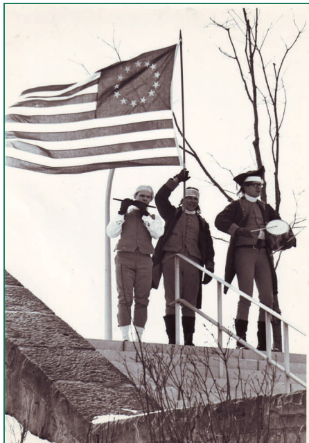
Point Park students recreate Spirit of '76 . If anyone knows more about this event, please email library@pointpark.edu .

www.pointpark.edu → Library → Online Resources—Databases → Performing Arts → Theatre in Video