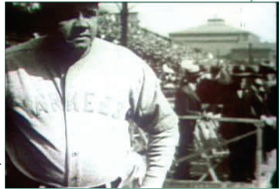
Still image from video of 1927 World Series.

So, get out there and enjoy the world of primary resources. Find Sir Walter Raleigh’s pirate licence from Elizabeth I, daily/hourly updates from the American ambassador during the 1917 Bolshevik Revolution, an algebra text from 1851, audio slave narratives recorded 1932-1975, Lady Bird Johnson’s diary – the possibilities are amazing.