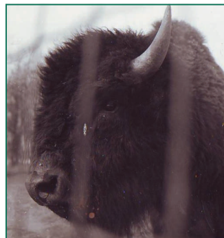
Short-lived (literally) bison mascot, Black Diamond II. b. 1966 - d. 1966.

In the meantime, enjoy some images from the archives.