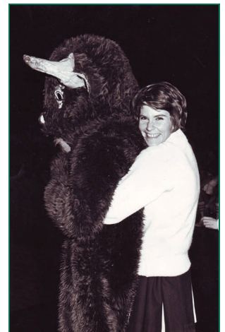
A more suitable mascot. Easier to feed. Easier to house. This one hopefully did not leave droppings on the basketball court floor like its predecessor.